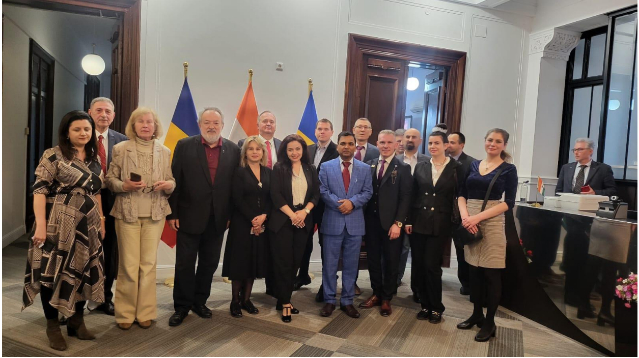
Group photo : Hybrid B2B Meeting on Tourism and Hospitality